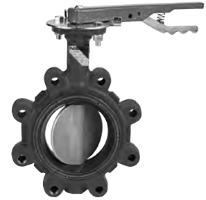
LD-3*22 Lug Style Optional Liner and CF8M Disc