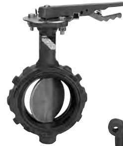
WD-3*22 Wafer Style Optional Liner and CF8M Disc